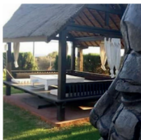
Copacabana Tarifa Beach:

Please contact the hotels directly for reservations.